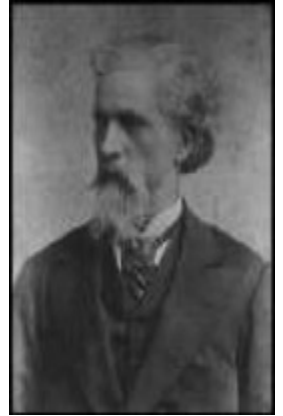
Colonel WC Falkner

To register for events and to enter the fiction contest or art exhibit